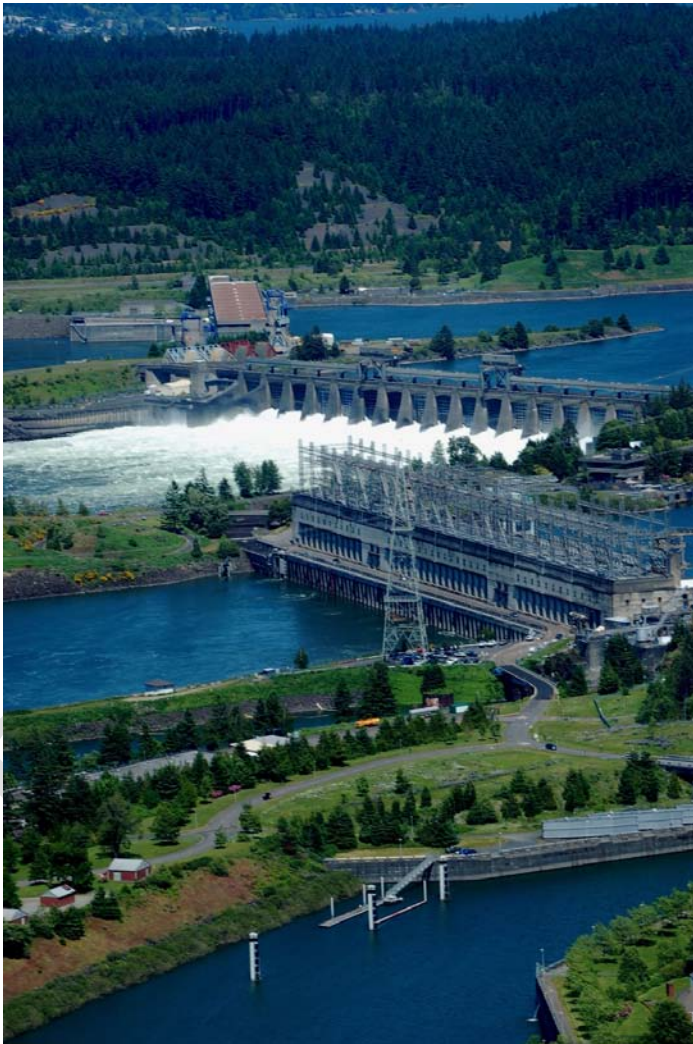
Bonneville Dam

Bonneville Power Administration U.S. Bureau of Reclamation U.S. Army Corps of Engineers